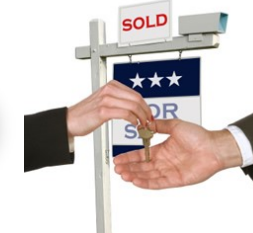
Buying and Selling Businesses