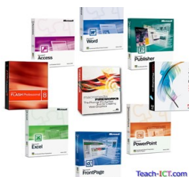
Bookkeeping Software Which Will Help You Run Your Business