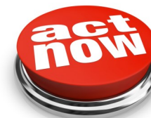
Things You Have to Do