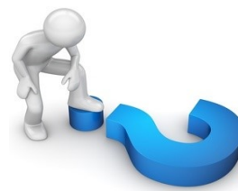
Things You Might Have to Do