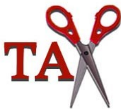
Things That Will Save You Tax