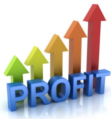
Things That Will Increase Your Profits